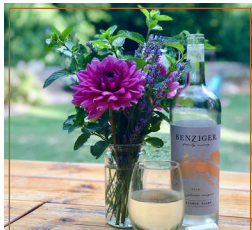
MAY 9 TH Spring Pick-up Party