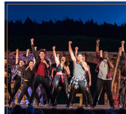
JUNE 27 TH Transcendence Dinner